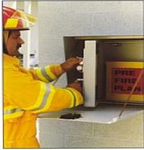
High Security Storage